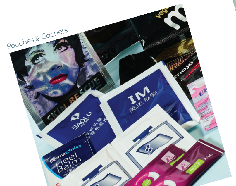
Pouches & Sachets