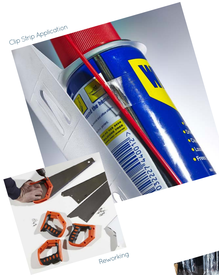
Clip Strip Application