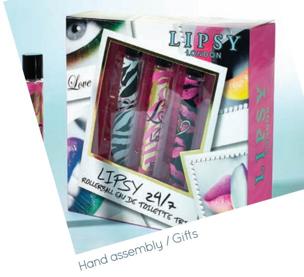
Hand assembly / Gifts