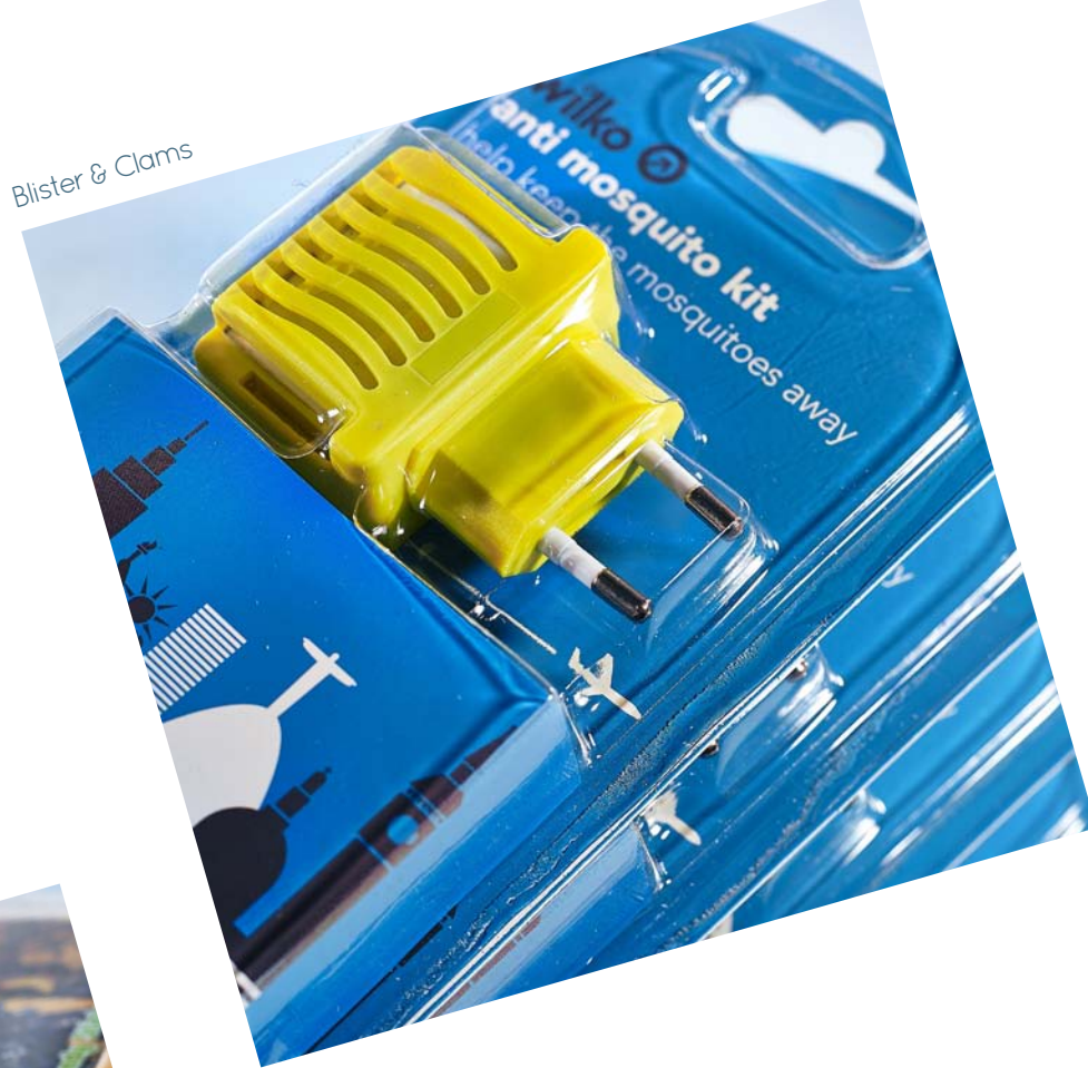
Blister & Clams